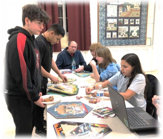
Above: Confirmation Class Game Night